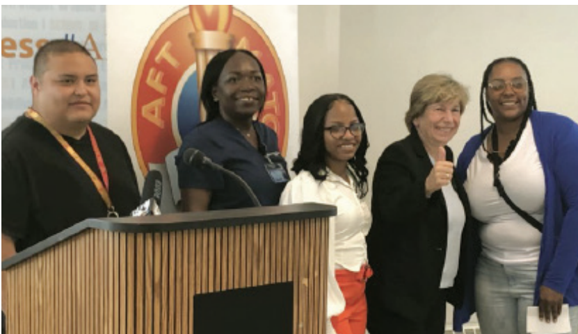
AFT President Randi Weingarten (second from right) poses with MATC students who received FAST Fund financial support.

Or watch the full press conference live streamed by AFT on Facebook.